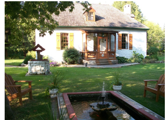
Spacious Grounds on the banks of the Red River