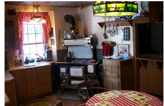
Fully equipped kitchen but with a heritage flavor