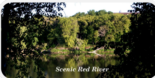
Scenic Red River

Ph: 204 482-5547 Cell 204 485-1569 Email: fstewart310@mts.net