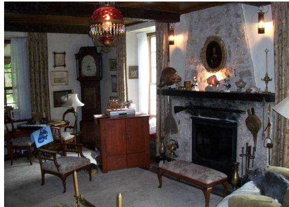
Living Room complete with Fireplace